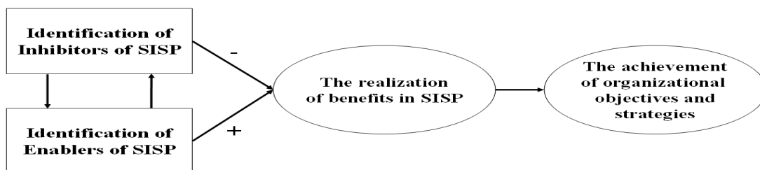
Fig 2. The proposed research model

Figure 2 is a diagrammatic representation of the proposed research model. This model shows the close interrelationships between inhibitors and enablers of SISP. Potentially inhibitors can be transformed into enablers by their identification and correction or minimization. It is postulated that overcoming inhibitors and enhancing enablers will lead to the realization of benefits from SISP, and in turn to achieving organizational objectives and strategies.