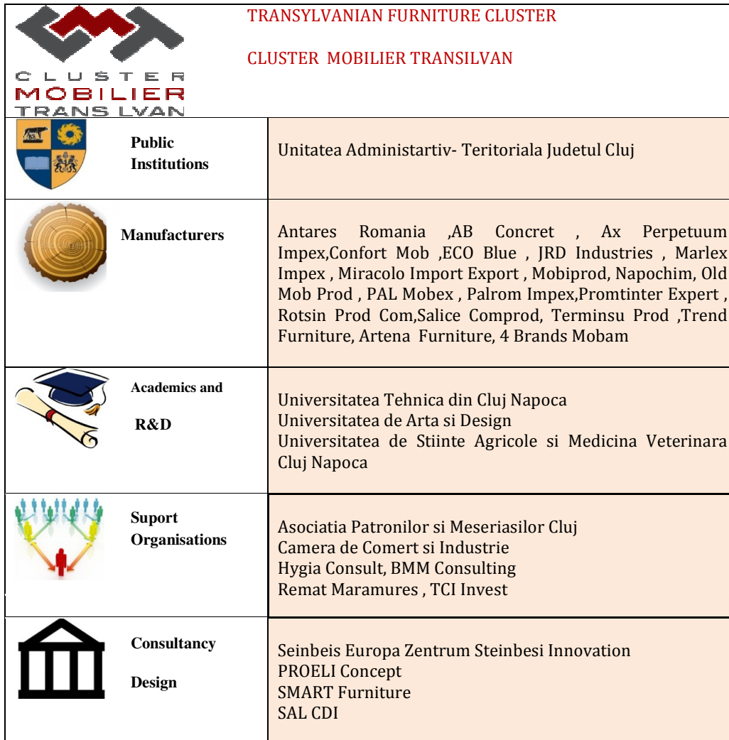
Table 1: Participant actors to Transylvanian Furniture Cluster

A survey upon the members of the cluster has been performed in order to establish the number and frequency between the members of the cluster