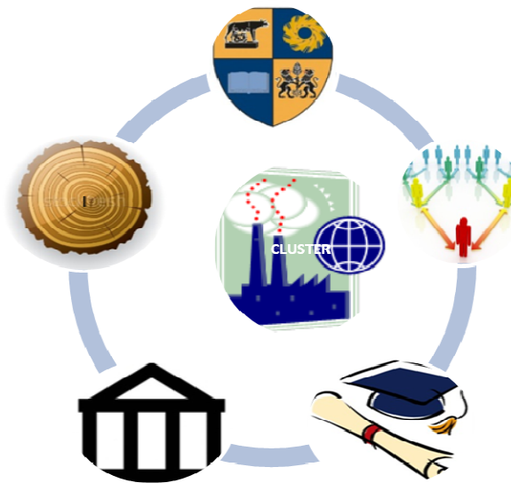
Figure2: Relationship between TFC members

Feedback related to these relationships can be measured using the results, namely the cluster's competitiveness.