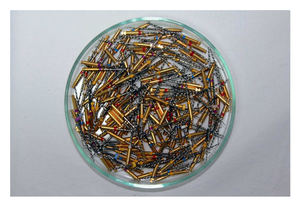
Figure 1: Separated files collected from different clinics.

Celebi University. First, numerous clinics in Turkey, were identified, and Izmır, containers were placed at these clinics for collecting broken files. The clinicians were instructed to discard files used used with an electric motor (X- Smart; Dentsply Maillefer) in very complex and severely curved or calcified canals but in accordance with manufacturer's recommendations . 120 files that separated during routine clinical endodontic procedures were classified into the following six groups according to their type: Sx, S1, S2, F1, F2, and F3 (Figs. 1). The classified instruments were cleaned ultrasonically and autoclaved. The length of the separated file was measured using an electronic digital caliper, and then, the separation length of each file was determined by subtracting the length at which separation occurred from the nonseparated file length . The obtained data was analyzed statistically by analysis of variance (ANOVA) and Tukey's post-hoc test using SPSS software.