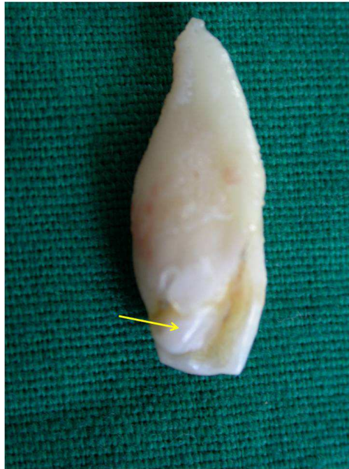
Figure 3: Extracted permanent mesiodens with talon cusp (arrow)