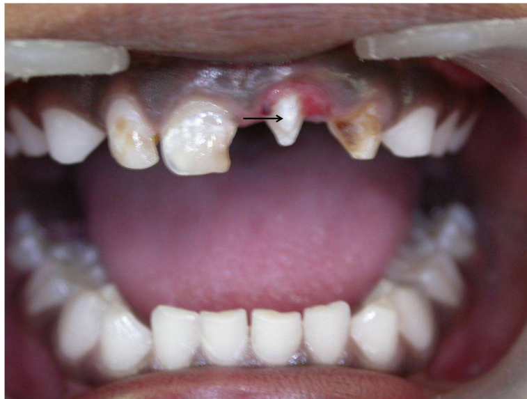
Figure 4: Supernumerary primary tooth with facial talon (arrow)