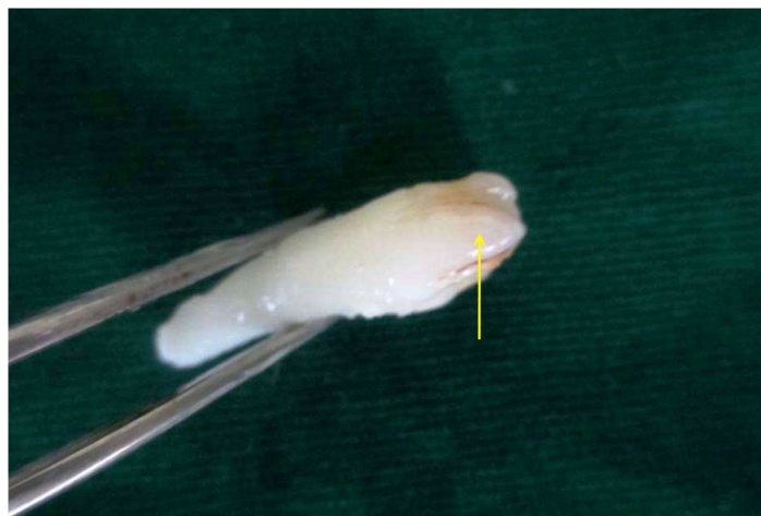
Figure2: Extracted mesiodens showing facial talon cusp (arrow)