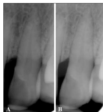
Figure 4: Periapical radiographs taken at baseline (A) and 6 months (B) at the mesial aspect of Tooth 22 in the SRP+PB group

Figure 3: Periapical radiographs taken at baseline (A) and 6 months (B) at the mesial aspect of Tooth 11 in the SRP+AP group