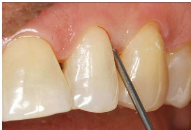
Figure 2: The PB or AP gels were gently loaded subgingivally into the periodontal pocket

and performed SRP, whereas other operators (MS & JK) administered the AP and PB gels. The patients were motivated to use an oral hygiene regimen for plaque control throughout the study.