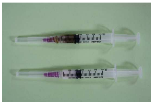
Figure 1: The AP (top) and PB gels (bottom)

The Faculty of Pharmacy, Mahidol University, Bangkok, Thailand created the preparations of AP and PB gel bases. The AP and PB gels were stored at 4°C throughout the study.