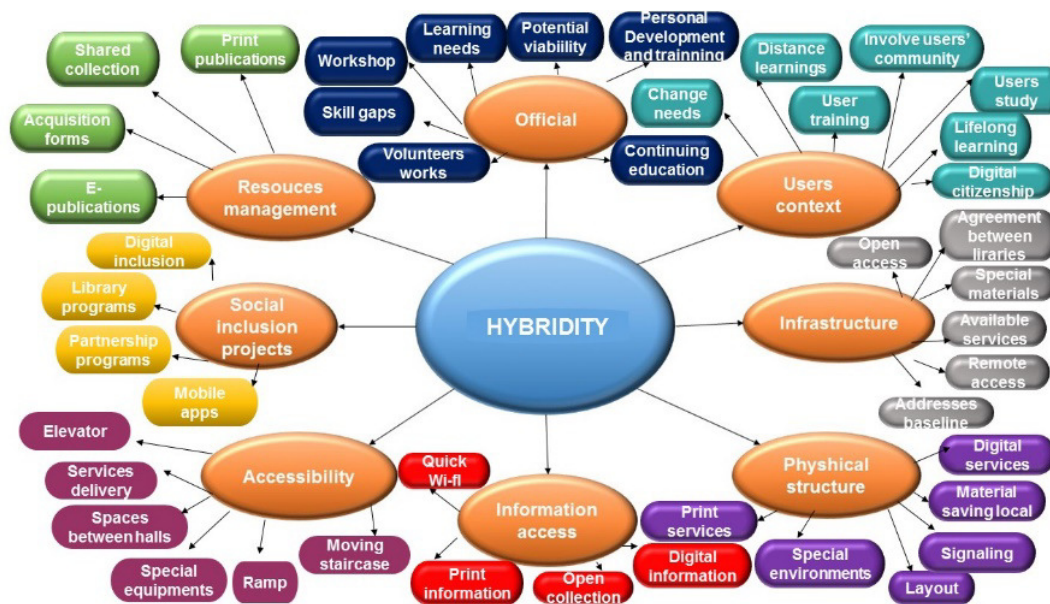
Fig. 2. Organizational environment of public hybrid libraries