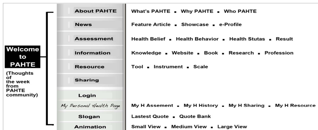
Figure 2. Structure of the Health Communication Platform

emphasis on the usefulness and easy-to-use structure as shown in Figure 2.