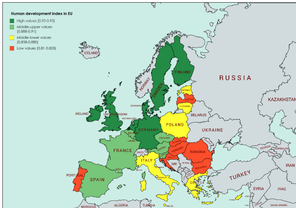
Fig. 1: Human development index in the European Union member states in 2017