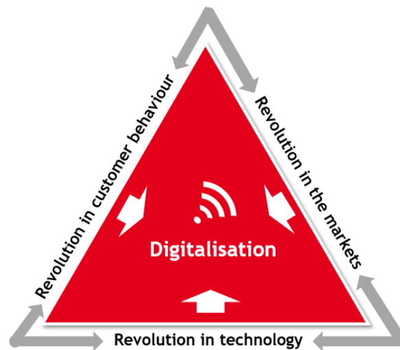
Fig. 2: Major changes related to digital transformation (Ilmarinen and Koskela, 2015).