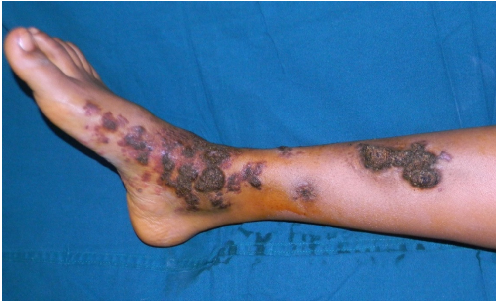
Figure 1 : Rt leg showing verrucous plaques, the upper one measuring more than 10 cm

the representative specimen showed compact hyperkeratosis, acanthosis and numerous ectatic vascular channels filled with red blood cells in the upper and mid dermis extending up to lower dermis [Fig2, Fig 3, ]. With this, a diagnosis of verrucous haemangioma was arrived at... Magnetic resonance angiogram (MR angiogram) of the right leg was done to delineate the depth of involvement. Since, there were no musculoskeletal and deep vascular connections; a planned excision of lesions with subsequent skin grafting was done in multiple stages [Fig 4].