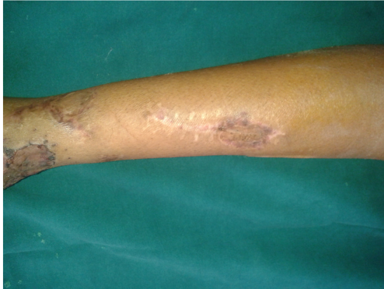
Figure 4: Four weeks post excision and grafting