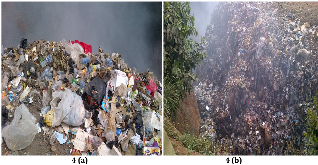
Figure 4 Composition of Waste at dumped and burnt at the dump site

waste paper and carton is sold for about ₦32,000, while other items are sold for ₦30, ₦30, ₦30 and ₦40 for plastic, glass, Tin can, and Nylon, respectively. These prices were given by the respective local vendor who buys and packed the materials for sale to recycling plants and companies in Lagos, Nigeria. Figure 4a shows the composition of potential recyclable waste stream that are indiscriminately dumped, while 4b shows the waste being burnt at the dump site.