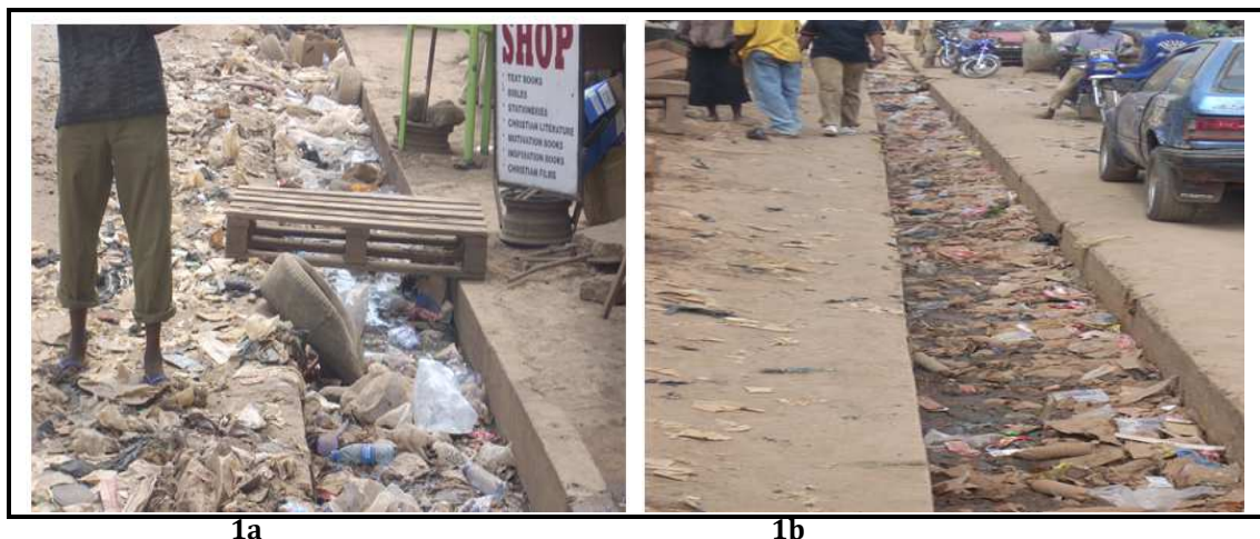
Figure 1: Indiscriminate Dumping of Waste in Drainages and Along the Road Sides

implemented environmental guidelines that complicate such problems.