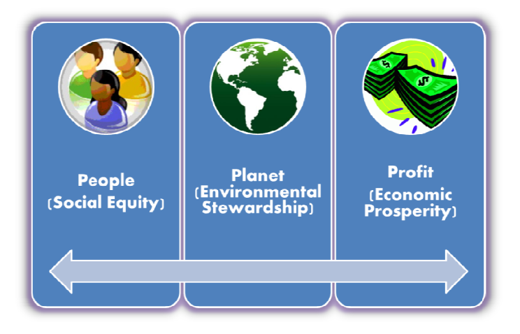
Fig 1: Triple Bottom Line

Research has indicated that increased attention to the 'triple bottom line' can have direct and indirect benefits on productivity, efficiency, security risks and corporate image. By assessing and improving the triple bottom line, companies benefit from increased operational efficiency, cleaner production, improved relations with stakeholders and increased access to new business opportunities.